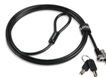
Kensington MicroSaver DS 2.0 Cable Lock from Lenovo