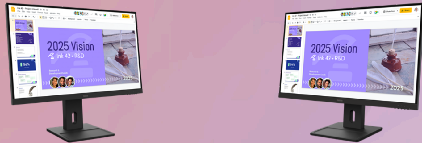
The product images are for illustration purposes only. Actual product appearance, ports, keyboard layout, and accessories may vary by model.