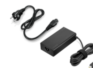
Lenovo USB-C 100W AC Adapter-AU GX21V60494