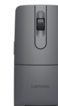
ThinkPad Bluetooth Presenter Mouse (Aura Edition) 4Y51T62792