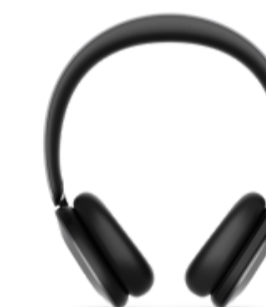
ThinkPad Dual-Mode Wireless ANC Foldable Headset 8550 (Aura Edition) - USB-A,... 4XD1V23301