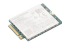
ThinkPad Rolling Wireless RW101R-GL SDX12 4G USB M.2 3042 module for CS2627 4XC1V64418