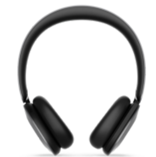
ThinkPad Dual-Mode Wireless ANC Foldable Headset 8550 (Aura Edition) - USB-A, ... 4XD1V23301