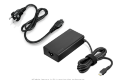
Lenovo USB-C 100W AC Adapter-AU GX21V60494